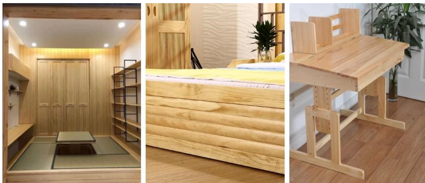
☐Radiation pine furniture production☐

Packaging industry: Due to its relatively low cost, easy processing and certain strength, it is often used to make all kinds of packaging boxes, trays and other logistics and transport packaging materials.