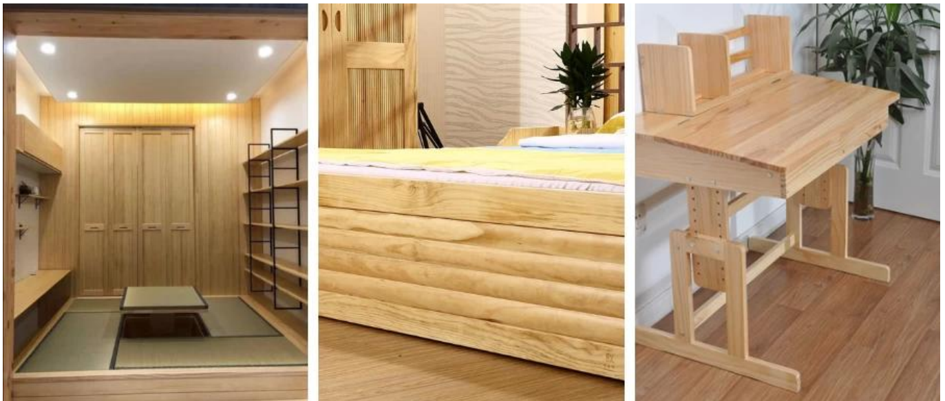
☐ Radiata pine drying lumber ☐

Packaging industry: Due to its relatively low cost, easy processing and certain strength, it is often used to make all kinds of packaging boxes, trays and other logistics and transport packaging materials.