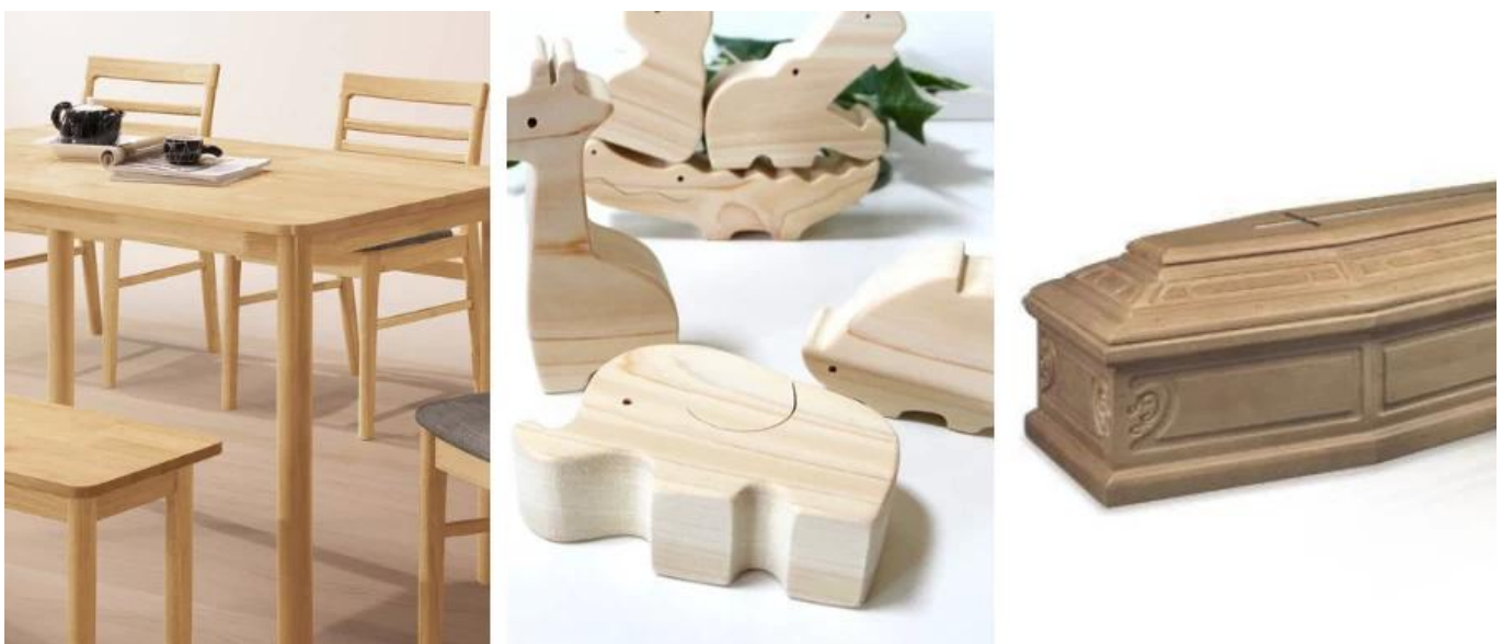
[ bleached paulownia wood production ]

Environmentally friendly and healthy: the bleaching process and related treatment chemicals we use are in line with environmental standards, to ensure that the product is harmless to human beings and the environment in the production and use of the process. At the same time, paulownia wood as a renewable resource, but also in line with the concept of sustainable development.