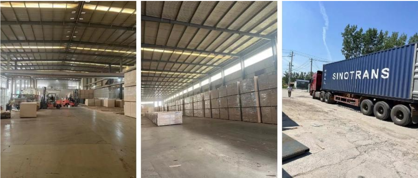
[China Straight Grain AA Radiata Pine Factory]

Standard grade: Allow knots and cores, good stability and compression resistance, moisture content of 9% on average and 12% maximum, suitable for the production of boxes, pallets and invisible parts of furniture fittings.